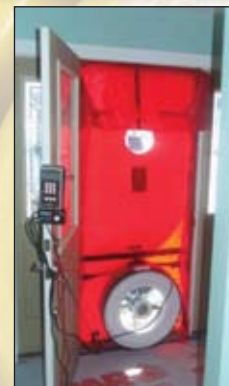
Photo of Blower door