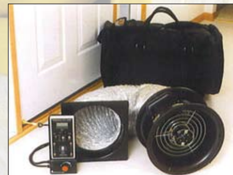
Photo of Duct Blaster equipment